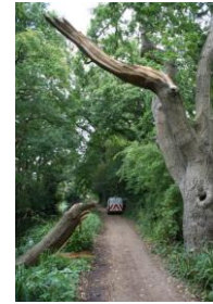
Broken limb at St Johns

A large limb came down in the St John's flight partially blocking the canal as well as total blockage below lock 4 by an oak tree, then two weeks later by a limb! Another oak fell across the canal below Lock 1, and the top of an oak snapped out and landed in the middle of the canal in Crookham. At Aldershot, an impressive 3 stemmed oak split like a peeled banana sending one tree right across the canal, which although appearing to block the navigation completely was squeezed passed by a hire boat at speed, despite reservations from rangers. All trees were cleared by the ranger team within 2 days of notification, most within 1.