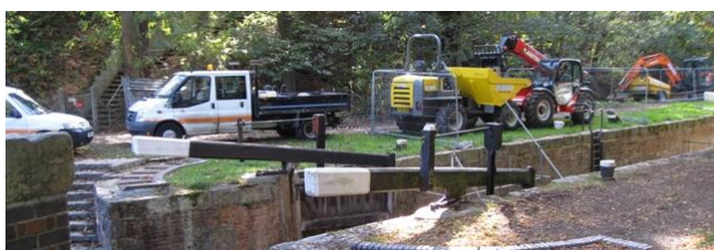
Above – Bank repair at Woking; Left - plant delivered to Lock 17. Right – Lock 20 being inspected by D&B